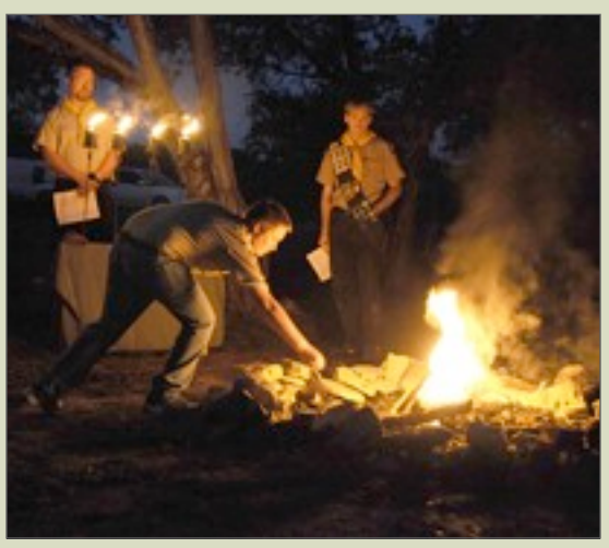
SERVICE TO GOD AND MAN

Pathfindering is more than just a club focused on camping and outdoor activities. Within its Pledge is the commitment to be a Servant of God and a Friend to Man. Service plays a strong role in Pathfindering; in the church and in the community. Pathfinders are encouraged to learn first aid and rescue skills, to take part in community service projects, and to take a role in spreading God's love through their words and actions. A true spirit of service creates leaders.